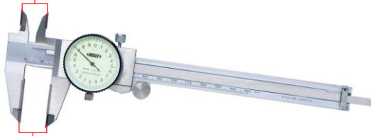
carbide measuring faces 1339-150